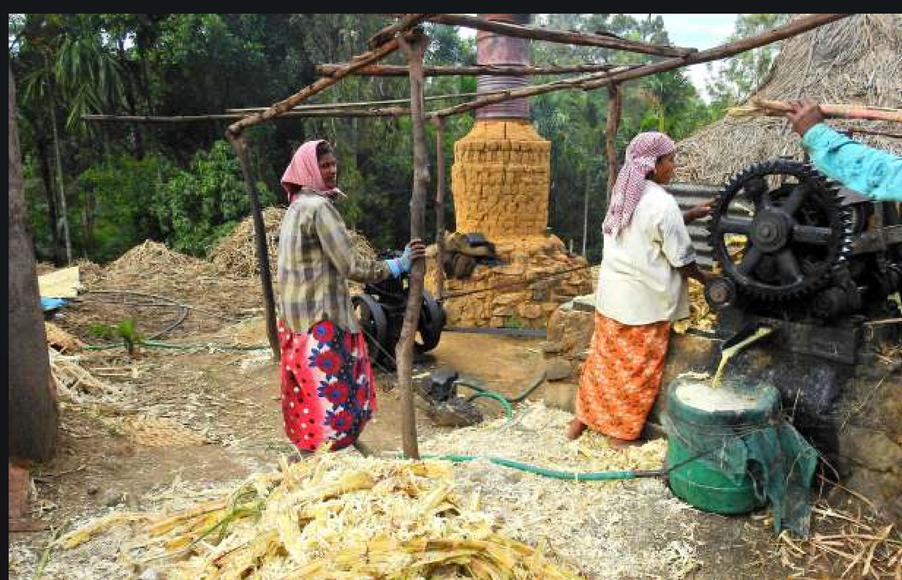
Sugar cane factory