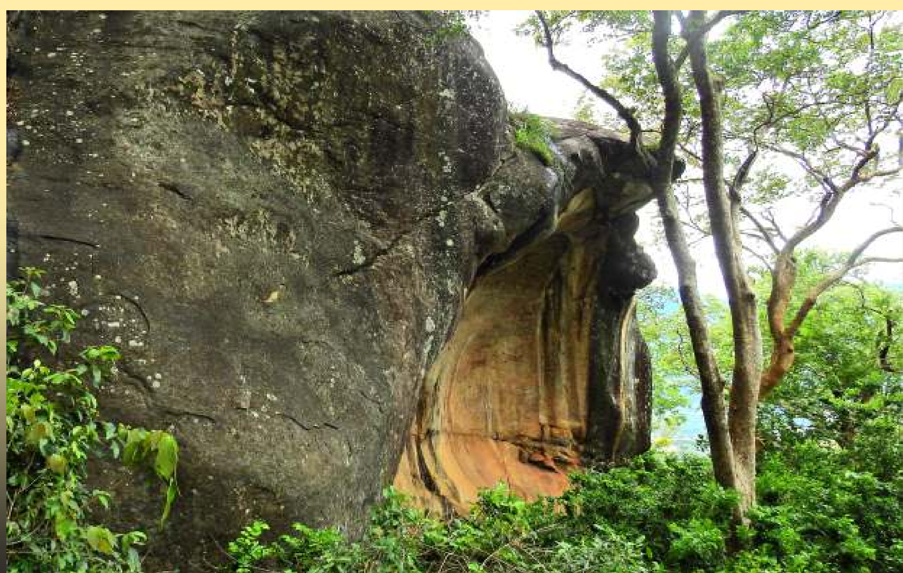
Ezhuthala Cave Paintings