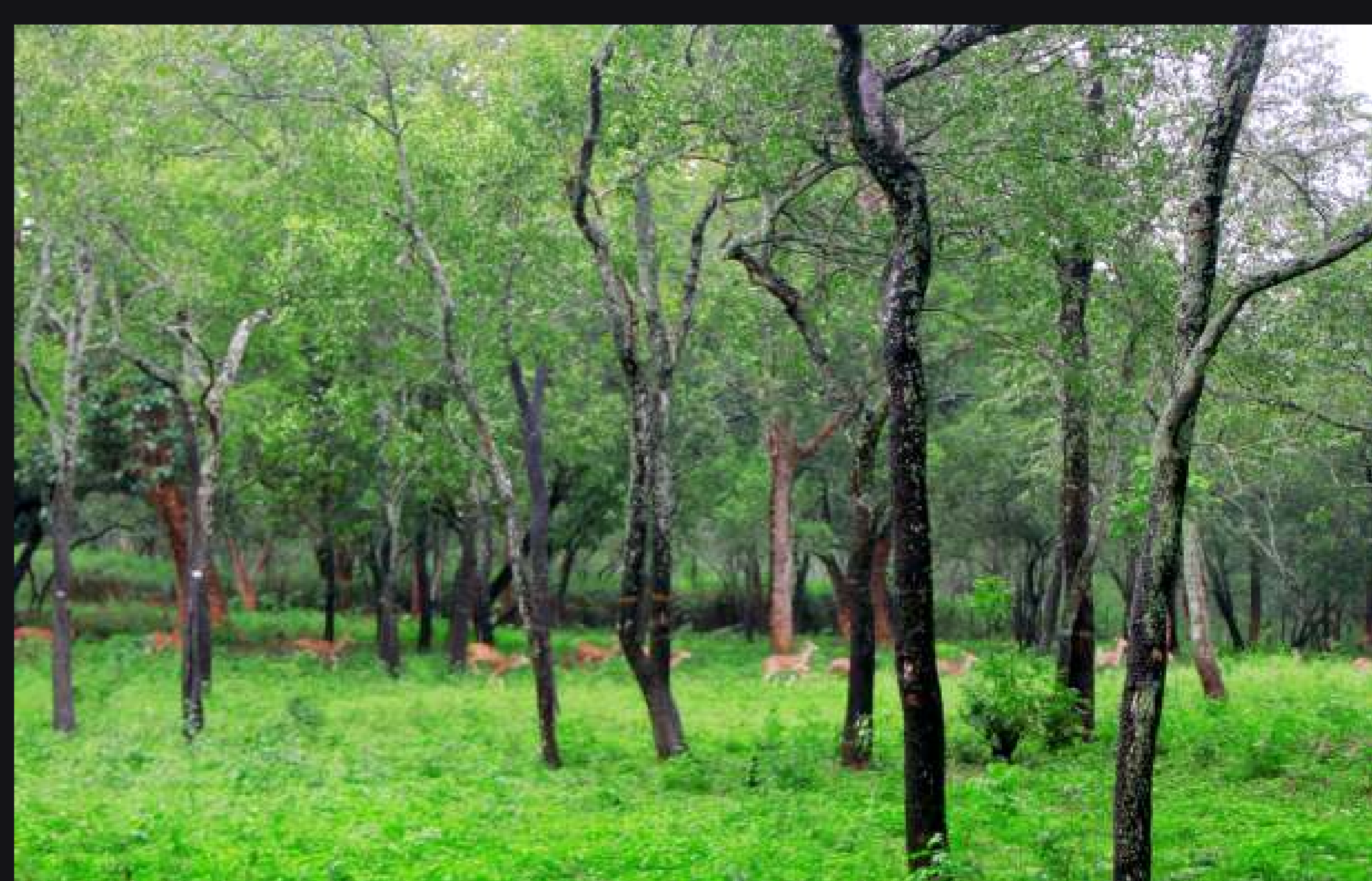
Nachivayal Sandal Reserve