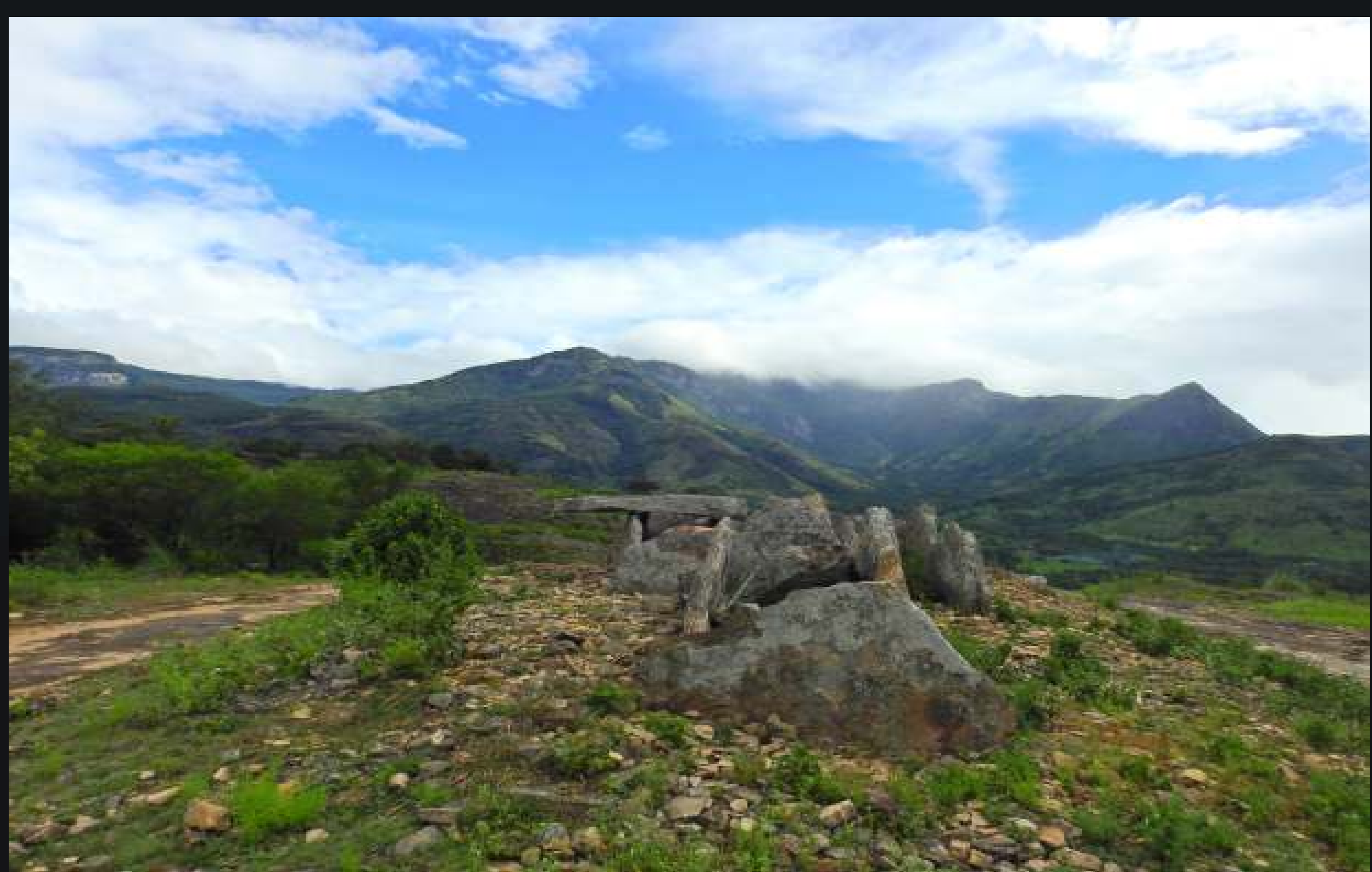
Anakottapara - Dolmens